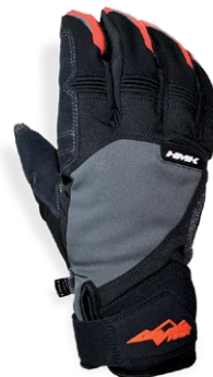
GRAY / ORANGE