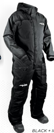
BLACK + INSULATED