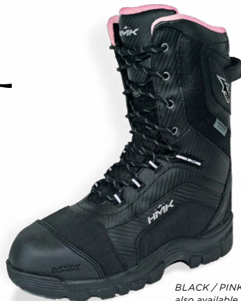
BLACK / PINK also available in BOA