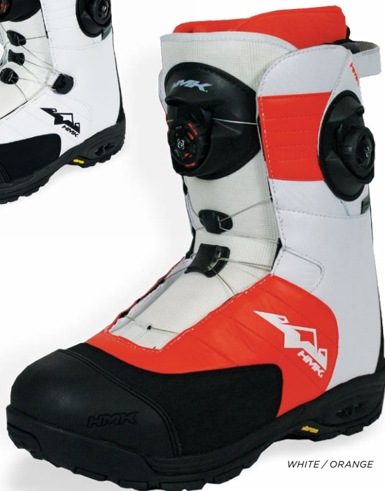
WHITE / ORANGE