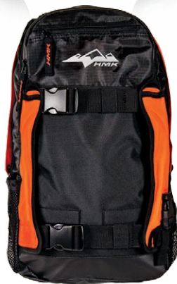
ORANGE / BLACK