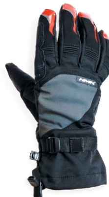
GRAY / ORANGE