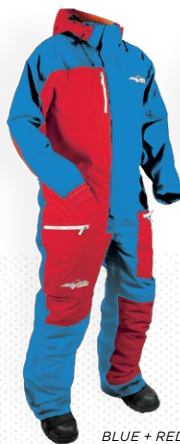
BLUE + RED

← { COLOR WAY SHOWN : BLACK + ORANGE } US Men's Sizing XS - 3XL