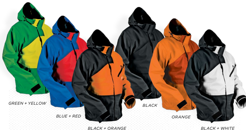
GREEN + YELLOW

← { COLOR WAY SHOWN : BLUE } US Men's Sizing XS - 3XL