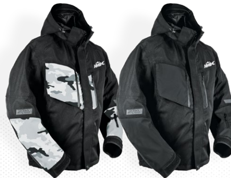
BLACK + CAMO

← { COLOR WAY SHOWN : BLACK + ORANGE } US Men's Sizing XS - 3XL