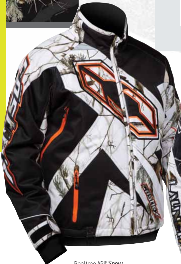
Realtree AP® Snow