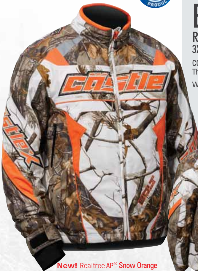
New! Realtree AP® Snow Orange