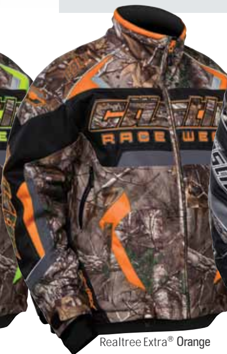
Realtree Extra® Orange