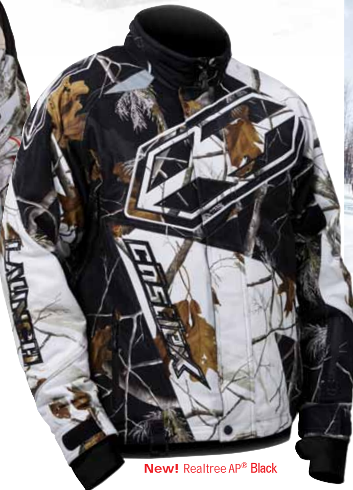
New! Realtree AP® Black