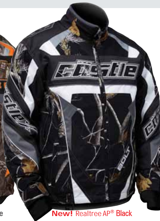
New! Realtree AP® Black