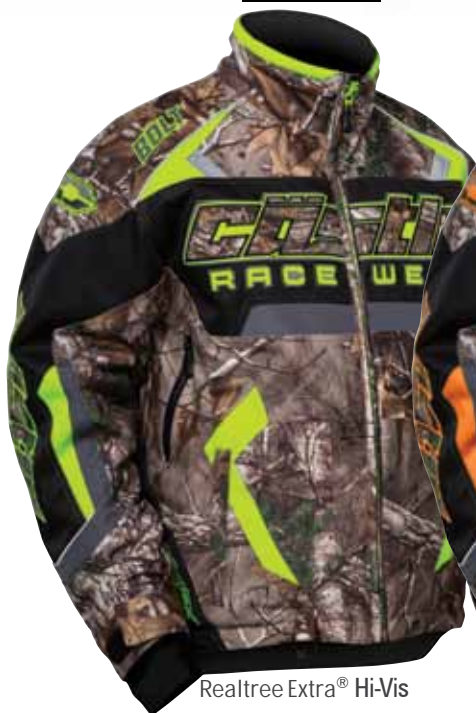
Realtree Extra® Hi-Vis