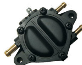
Dual - Pentagon - Flush