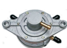
Dual - Round - Bracket