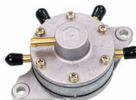
Triple - Round - Flush