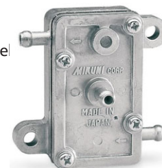
Single - Rectangular - Flush