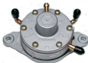
Dual - Round - Flush