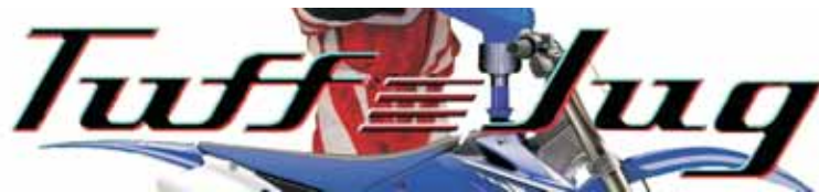
10 Litre Design Ideal for 4-stroke Models