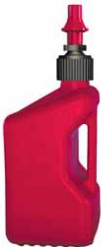
20 Litre Design More Fuel for longer outings