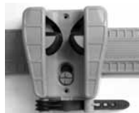
Multi Purpose Handle Holder 664-8200