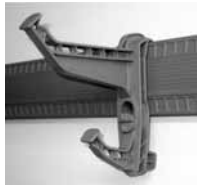
5 " Hook 664-8100