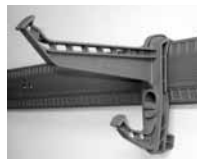
7" Hook 664-8200