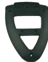
630-CL1 - Main Outer Frame