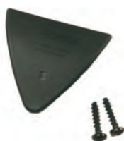
630-CL4 - Triangle Click Hook