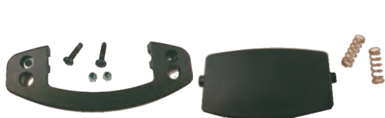
630-CL2 - Frame for Click Mechanism