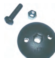
630-CL5 - Inside Mounting Button