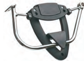
630-CL0 - Complete System Shown mounted