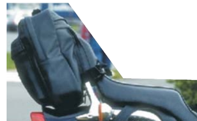
630-R2 mounted on bike