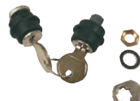
630-HC-LOCK Lock and Key