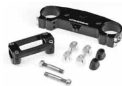
4 bolt Bar Mount, Bar Mount Insert, Triple