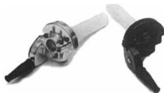
PULL THROTTLE E44-97750 $14.95-J • Excellent replacement for ATV thumb style throttle • All aluminum body, allen head screws • Cable adjuster with rubber boot all combine to make a top quality throttle • Each throttle is point of sale display blister slide packaged.