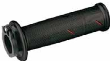
700 Road $47.95-J Black/Grey (Ducati/Suzuki/Yamaha) 709-7110 Black/Grey (Aprilia/Honda/Kawasaki) 709-7111