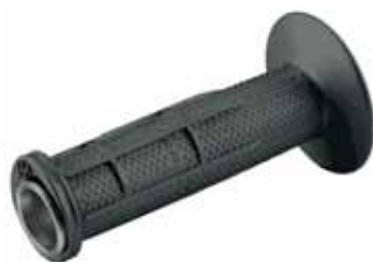
800 MX Dirt $47.95-J Black 2-stroke 709-7120 Black 4-stroke 709-7121