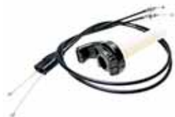
MIKUNI THROTTLE ASSEMBLY 708-410 $120.50-J • For use with all Mikuni VM and RS carbs • Includes two cables • Push-pull assembly type.