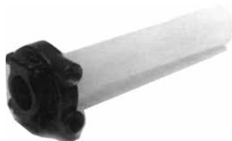
PUSH-PULL THROTTLE E44-97770 $18.95-J • Die cast aluminum housing with a nylon sleeve • Housing has threads to accept standard Honda push-pull cable system • Each throttle is point of sale display blister slide packaged.