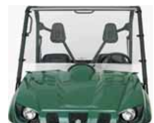
Rhino Full Shield 617-5503