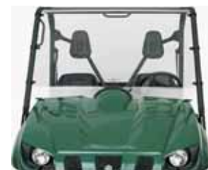
Rhino Full Shield 617-5503