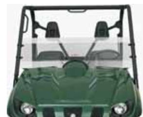
Rhino Half Shield 617-5603