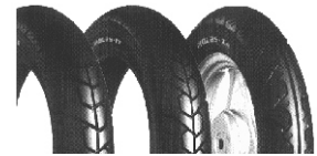
ML16 ML17 ML24