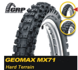
GEOMAX MX71 Hard Terrain