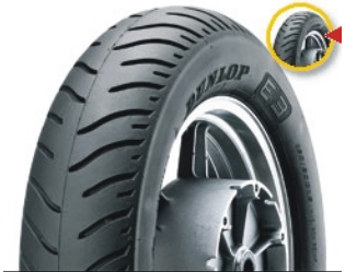
ELITE 3 BIAS Bias-Ply Touring