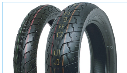
K700 / K701