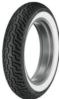
WWW - Wide Whitewall Profile