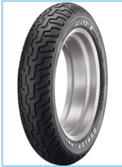
491 Elite II