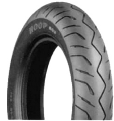
B03 Front Hoop Tire