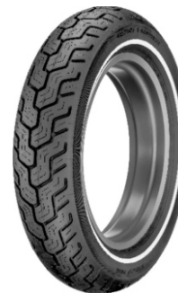
SW Profile - Small Whitewall