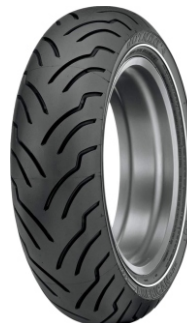
NWS Profile - Narrow White Stripe