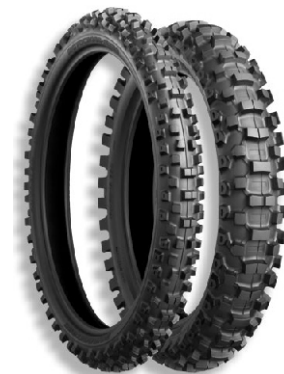
M203 & M204