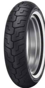
MWB Profile - Medium White Band

Dunlop is the original brand of tire certified to say Harley-Davidson