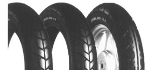
ML16 ML17 ML24