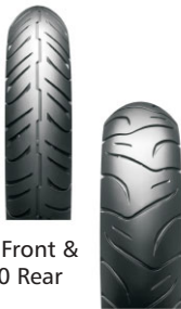
G851 Front & G850 Rear