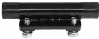
Steering Post Pivot Adapter