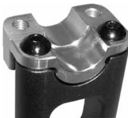
Steering Post Offset Adapter Kit

* Since these pivot adapters put the risers on the outside of the steering post plate the widths of the clamping surface varies. Double check the clamp surface area width on your stock bars to make sure it is wide enough for the risers to clamp down on a flat surface and not into the curve of the handlebar. If the clamping surface is too wide for your stock bars you will need an RSI offset adaptor clamp kit.