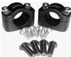
Black Handlebar Clamp Kit