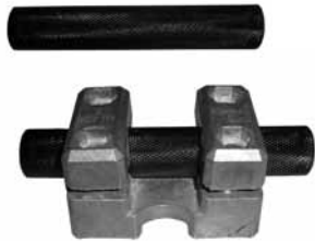
Steering Post Pivot Tube