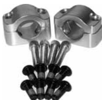
Silver Handlebar Clamp Kit