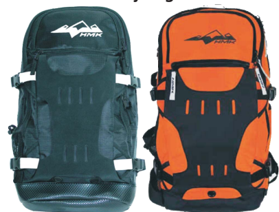
Recon or Summit Bag