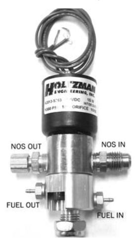
Nitrous & Fuel Solenoid