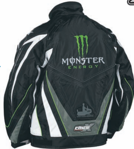
MENS MONSTER ENERGY SWITCH JACKET AND