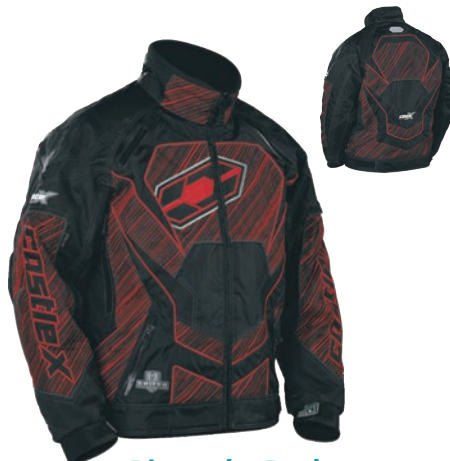
Pinned - Red