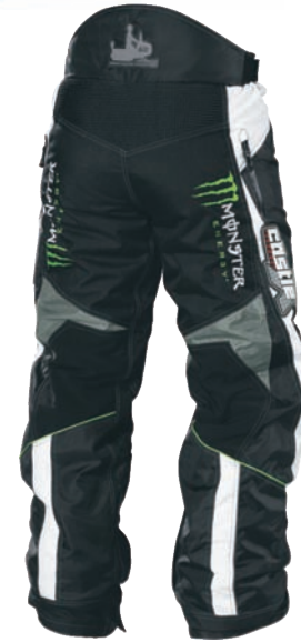
PANTS SIZES XS TO 2XL $269.95-1 *