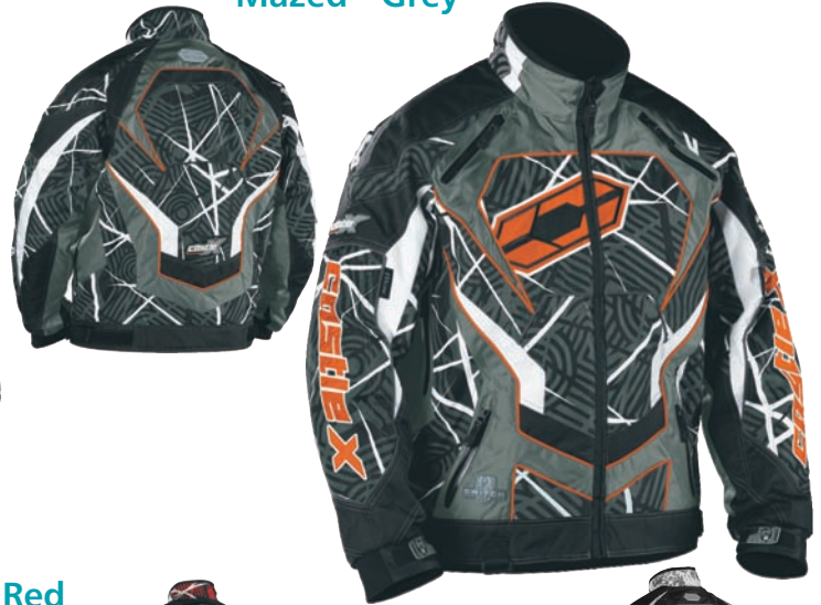
Mazed - Grey