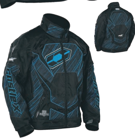
Pinned - Blue