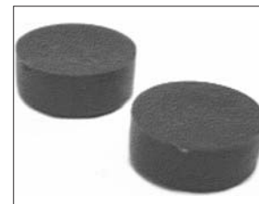
214-5115 OEM 5430445 / 5430728