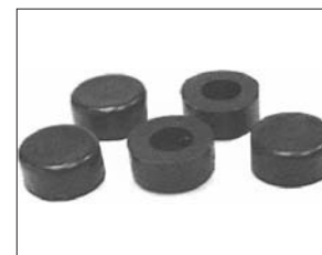
214-5116 OEM 5430269