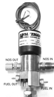
Nitrous & Fuel Solenoid