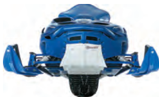
Yamaha Pro Action Chassis