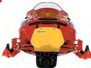
Polaris Edge Chassis