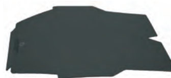
Yamaha V-Max 500/60 (94-96)