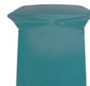
Ski Doo S-2000 ('97-01)