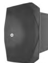
Polaris Evolved Chassis