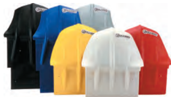
Holeshot Skid Plate Colors

Holeshot's original 3-rib design combined with heavy gauge HMW (High Molecular Weight Polyethylene) material provides superior protection against rocks and other obstructions hidden in the snow. Holeshot Skidplates offer the best fit, the best protection and the best colors for Polaris, Yamaha and Ski-Doo snowmobiles.